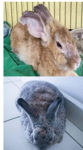
Figure 4. Rabbit with scabies severity level. (Right) Shows a rabbit with a mild scabies severity and (Left) rabbits with moderate severity.

Figure 4 (Right) shows a rabbit with a mild scabies severity. Rabbits with this severity found clinical symptoms in the form of alopecia and crusting in the facial region including the mouth, nose, eyes, and ears. Rabbits with moderate severity have clinical symptoms in the form of alopecia and crusting in the facial and body regions which can be seen in below in Figure 4 (Left).