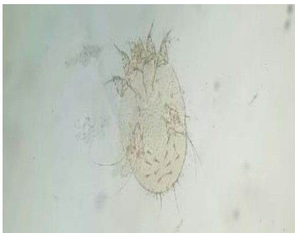
Figure 2. Sarcoptes scabiei mite on the results of native skin scrapings under a microscope with a magnification of 100x.