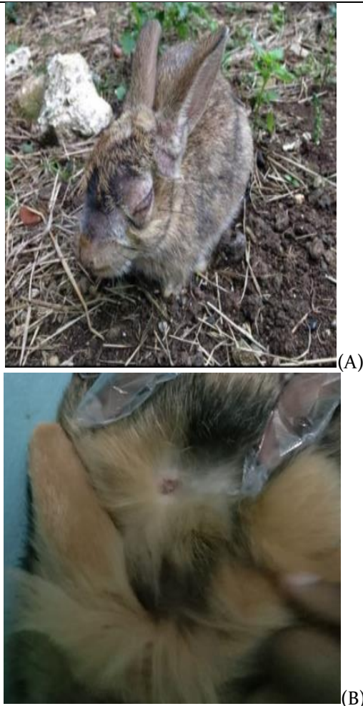
Figure 1. (A) Clinical symptoms of scabies in the form of alopecia and mild crust around the body region. (B) Clinical examination of rabbits with clinical symptoms of scabies in the form of alopecia around the face whereas nose and eyes region.